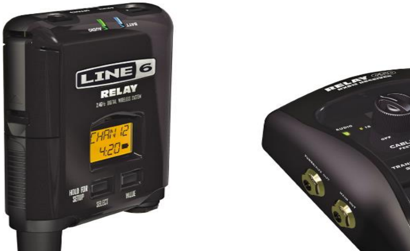
Line 6 relay G50 Wireless guitar