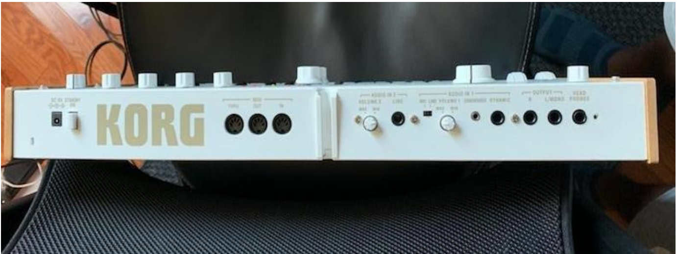
KORG Micro Key side view