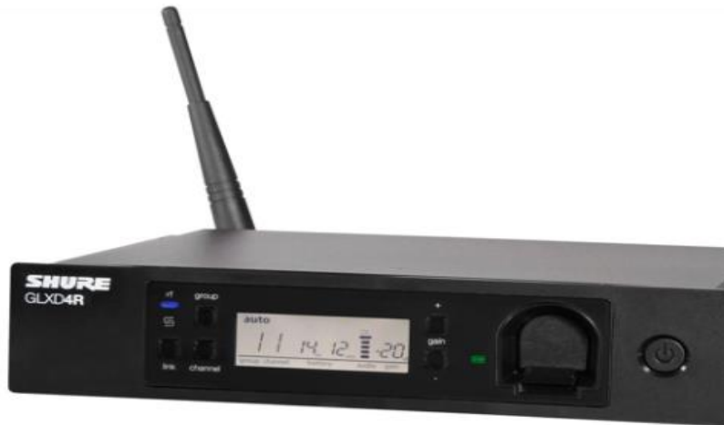
Shure GLXD14R wireless receiver system