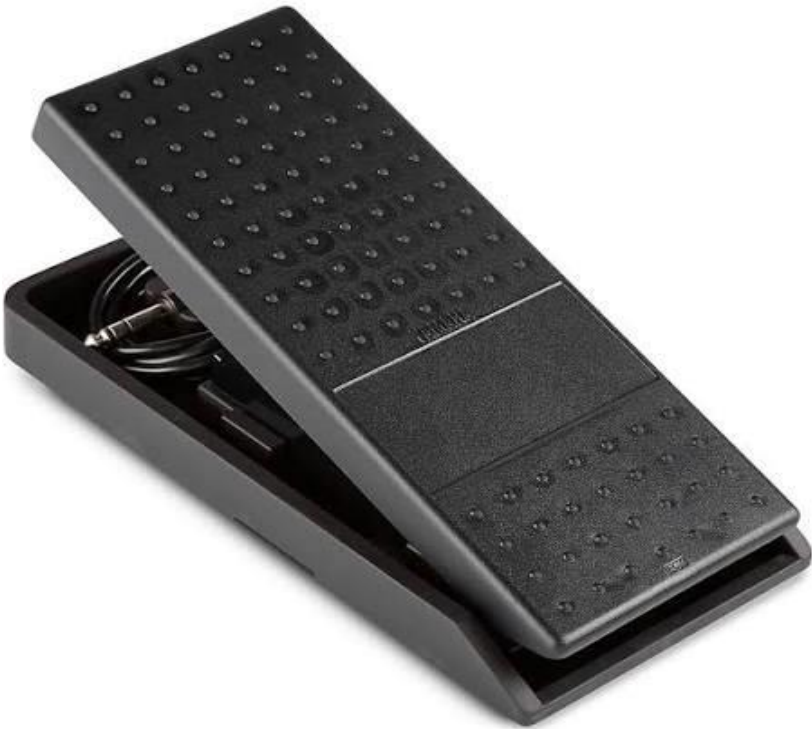
Yamaha FC7 volume pedal