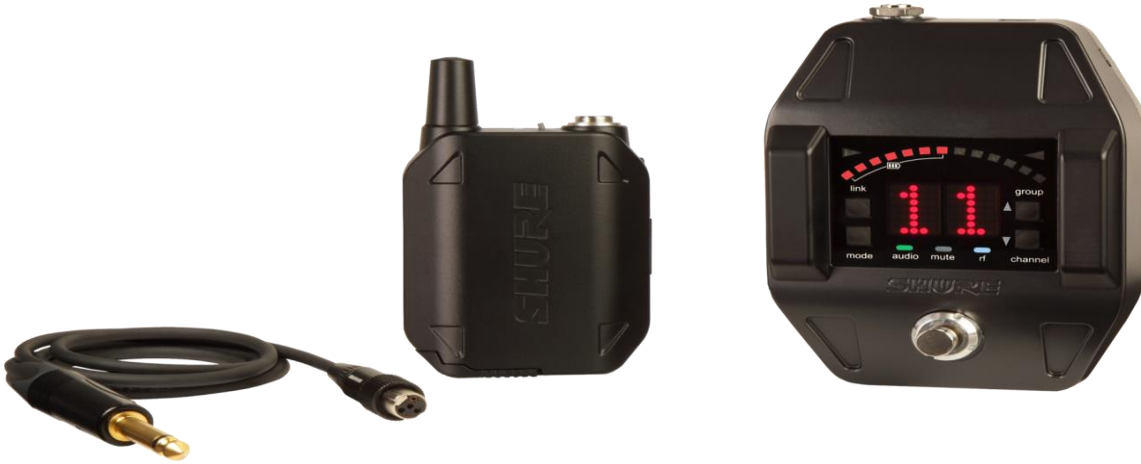
GLXD16 Wireless guitar receiver