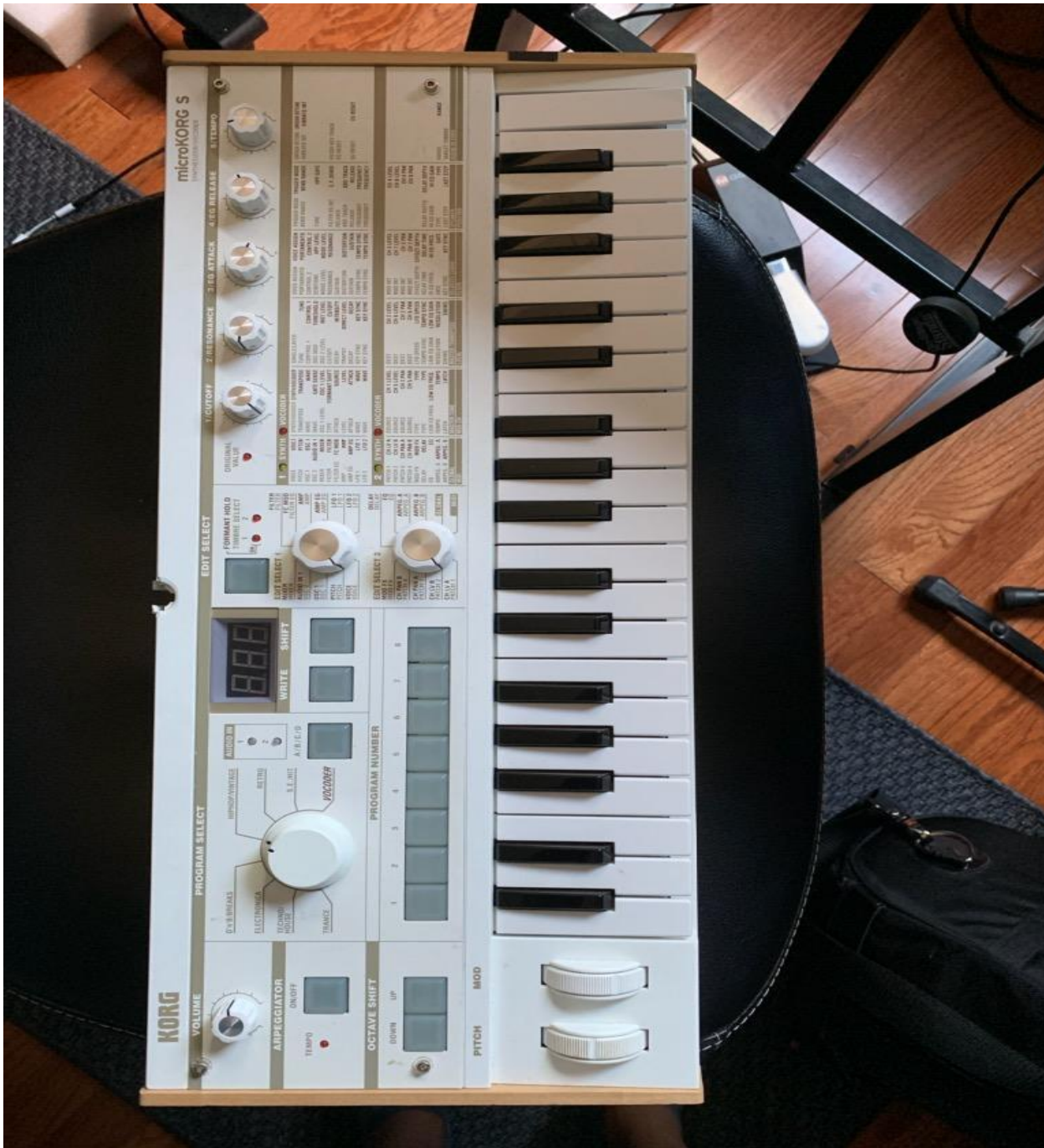
KORG Micro Keys